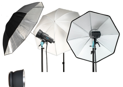
33.576.00 Focus 110 silver/black Ø 110 cm 33.496.00 Umbrella reflector 33.570.00 Silver/black Ø 105 cm 33.571.00 White/black Ø 105 cm 33.572.00 Transparent Ø 105 cm 33.573.00 White/black Ø 85 cm 33.574.00 Silver/black Ø 85 cm 33.575.00 Transparent Ø 85 cm