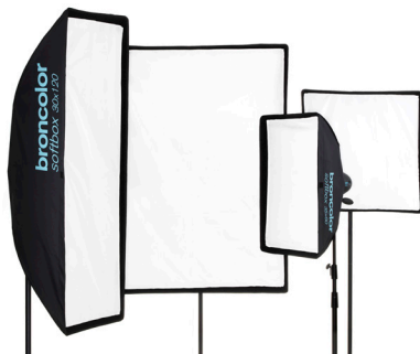
Softbox 33.560.00 35 x 60 33.561.00 60 x 60 33.562.00 60 x 100 33.563.00 100 x 100 33.564.00 30 x 120 33.565.00 90 x 120 33.566.00 120 x 180 33.567.00 30 x 180