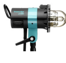
Unitite 1600 J 32.113.XX Unitite 3200 J 32.114.XX