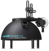
Scope D50 82.110.XX Scope D50 UV/IR 82.130.XX