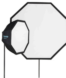
Octabox 33.600.00 75 33.601.00 150