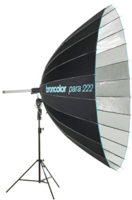
Para 222 Kit without adapter 33.552.03