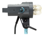
Pulso G 1600 J 32.115.XX Pulso G 3200 J 32.116.XX