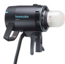
Pulso L 1600 J 32.130.00 Pulso L 3200 J 32.131.00