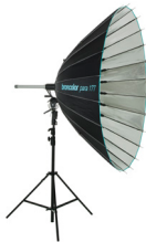
Para 177 Kit without adapter 33.551.03