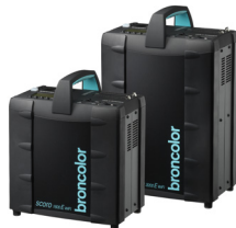
Scoro 1600 E WiFi / RFS 2 31.066.XX Scoro 3200 E WiFi / RFS 2 31.067.XX