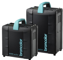
Scoro 1600 S WiFi / RFS 2 31.046.XX Scoro 3200 S WiFi / RFS 2 31.047.XX