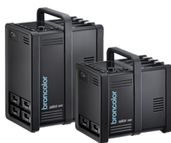
Sator 3200 31.071.XX Sator 1600 31.070.XX